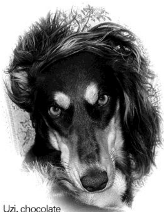
Uzi, chocolate (Jude x Zoey)